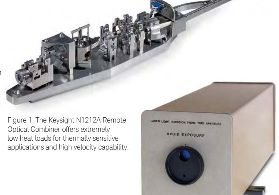
Figure 2. Keysight 5517 Lasers offer a wide range of specifications that can be selected to optimize system performance.