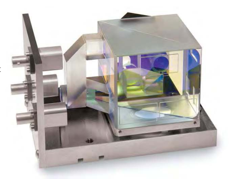
Figure 4. Keysight's multi-axis interferometers are designed and produced using our unique Complex Monolithic Optics (CMOs) technology and provide extreme precision and reliability in a compact form factor.