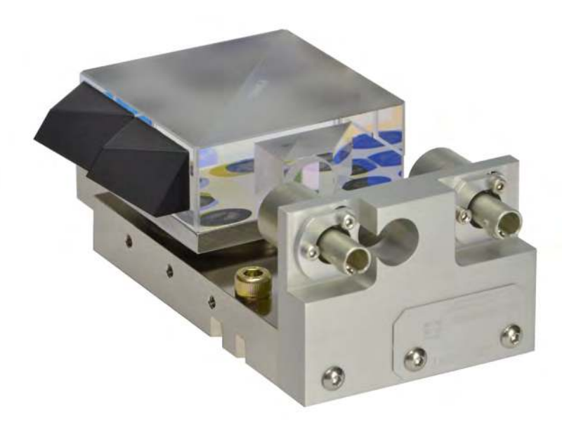
Figure 6. Keysight's unique CMO technology allows us to design and manufacture standard and custom interferometers that are highly accurate, never need alignment and are light weight and space efficient.

And, unlike optical design labs that outsource manufacturing, Keysight offers comprehensive and proven services from initial concept through volume production, even for complex assemblies. The result: faster turnaround, clear accountability, and the benefits of decades of real world manufacturing experience.