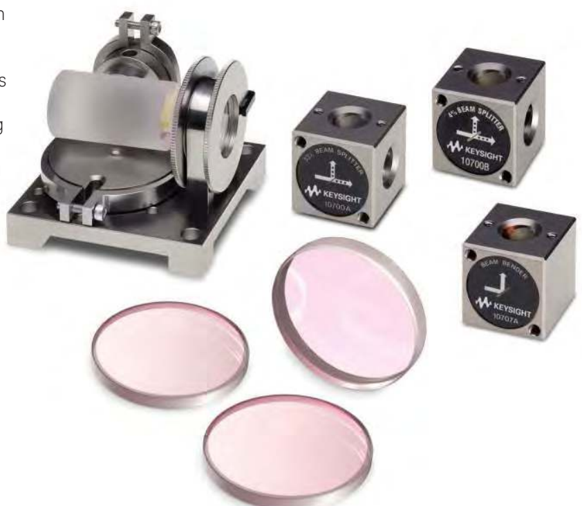
Figure 5. A broad selection of beam directing optics and mounts are available for integration into complex multi-axis measurement systems.

Keysight is a world-leader in the design and fabrication of precision optics. The accuracy of your measurement depends upon the optical components used in your system. Keysight offers a number of beam delivery optics ranging from bare optics to beam translation components which are built to exacting wavefront specifications.